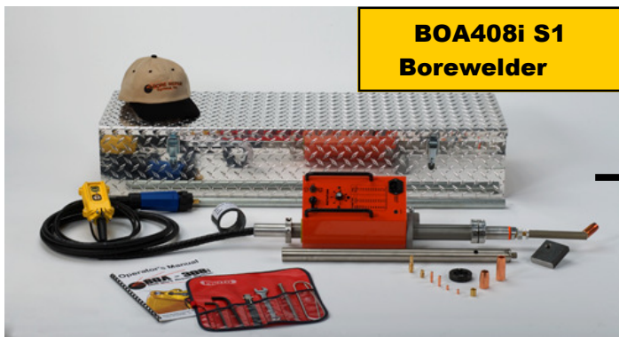
BOA408i S1 Borewelder

Model: BRS2, BRS3 and BRS4—(Typically used for heavy equipment bore repair)